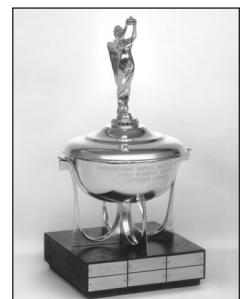
Jr. Naples Sabot Trophy Jr. Naples Sabot A

Hospitality: No-host bar after racing both days. Dinner is available Sunday.