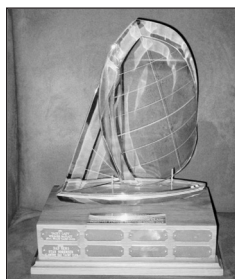
SBYRC Sport Boat Sport Boat