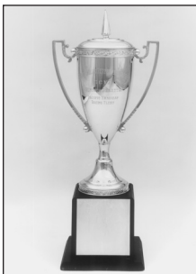
Harry Wills Trophy PHRF C

Boats from fresh water lakes are welcome if they have evidence that they have been out of the water for 90 days.