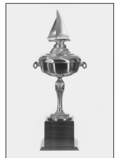
Frank Dair Trophy PHRF B